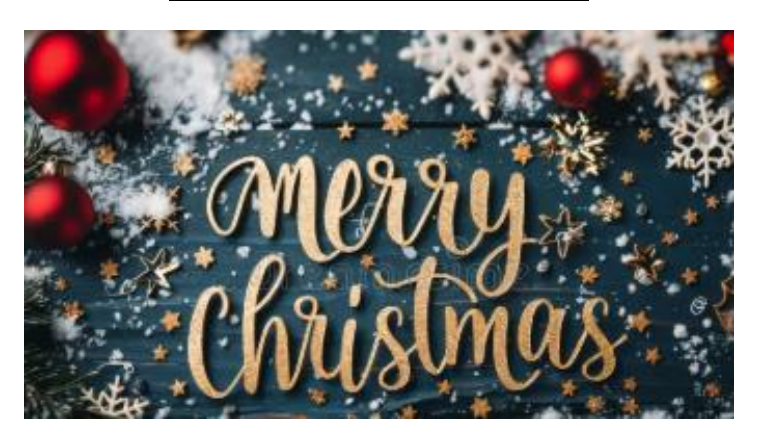
On Friday 13<sup>th</sup> December, we will be celebrating 'Christmas in a Day'.

This day coincides with our Christmas dinner day. Pupils can come to can wear a Christmas jumper alongside their school uniform.