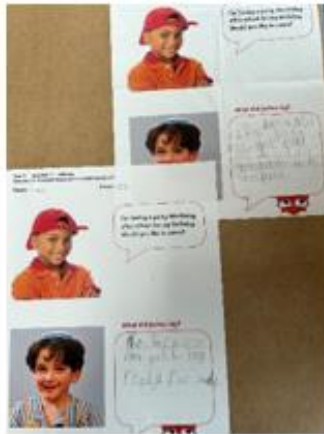
Judaism Year 1