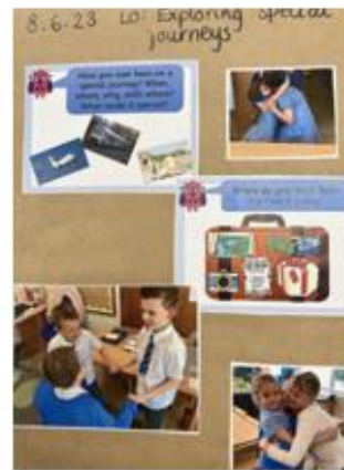
Islam Year 2